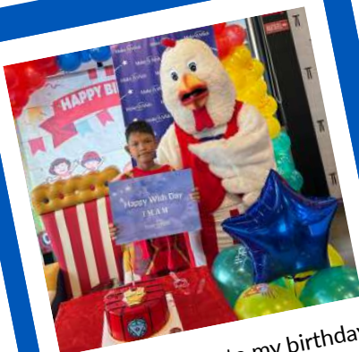
I wish to celebrate my birthday Imam, 10 / Leukemia