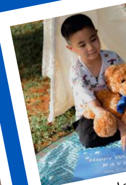
I wish to go to La Davin, 7 / Anem