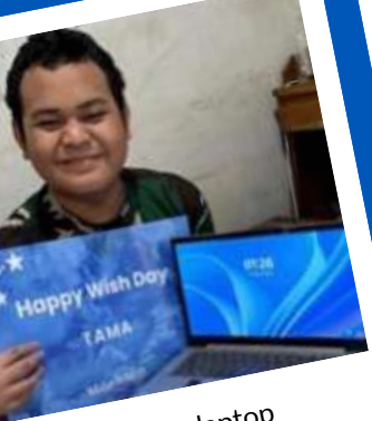
I wish to have a laptop Tama, 16 / Osteosarkoma