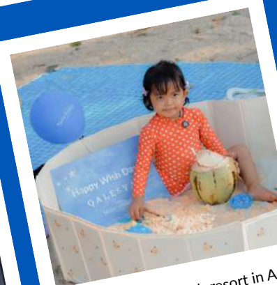
I wish to go to a beach resort in A Galey, 5 / Leukemia