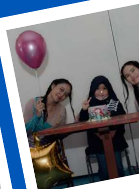
I wish to meet a n Azqilla, 5 / Leukemia